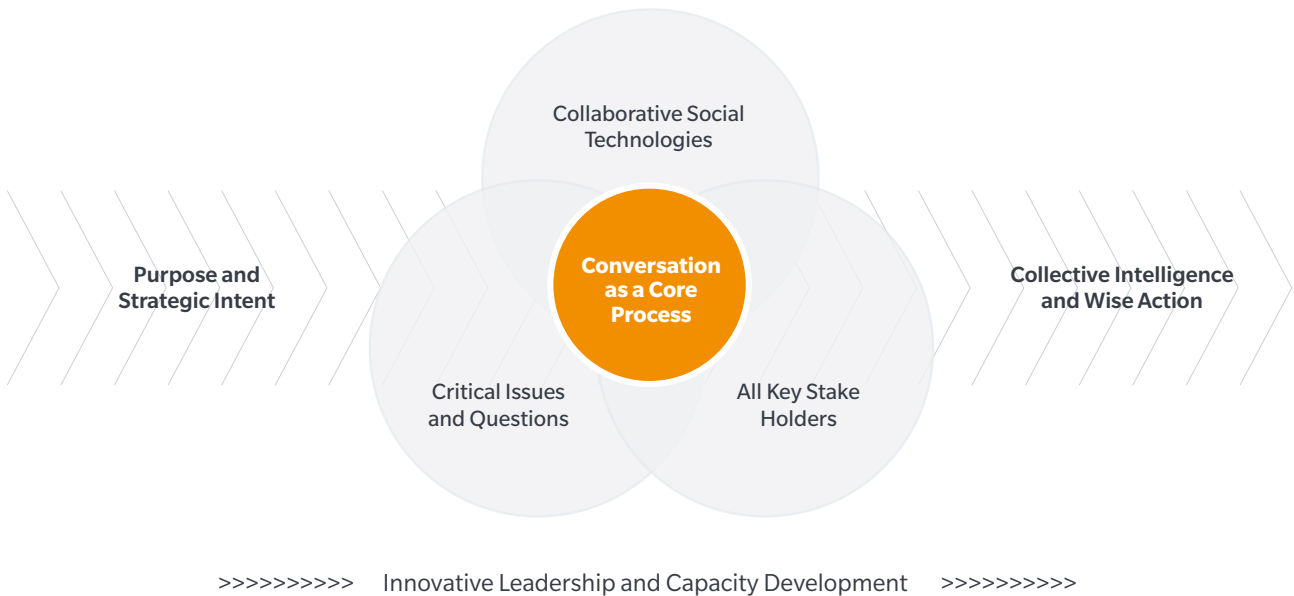
Exhibit A: Conversational Leadership: Creating Architectures for Engagement

social media such as blogs, wilds, and online communities of practice let us extend, enrich, and deepen conversations and collaboration among an ever-expanding number of participants. As new possibilities and the coordinated actions based on them start in small groups and then spread through wider networks, we bring the future into being.